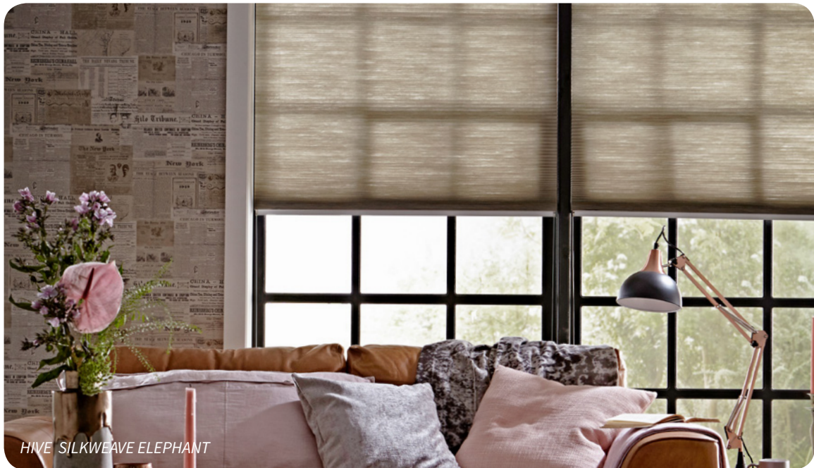
HIVE SILKWEAVE ELEPHANT