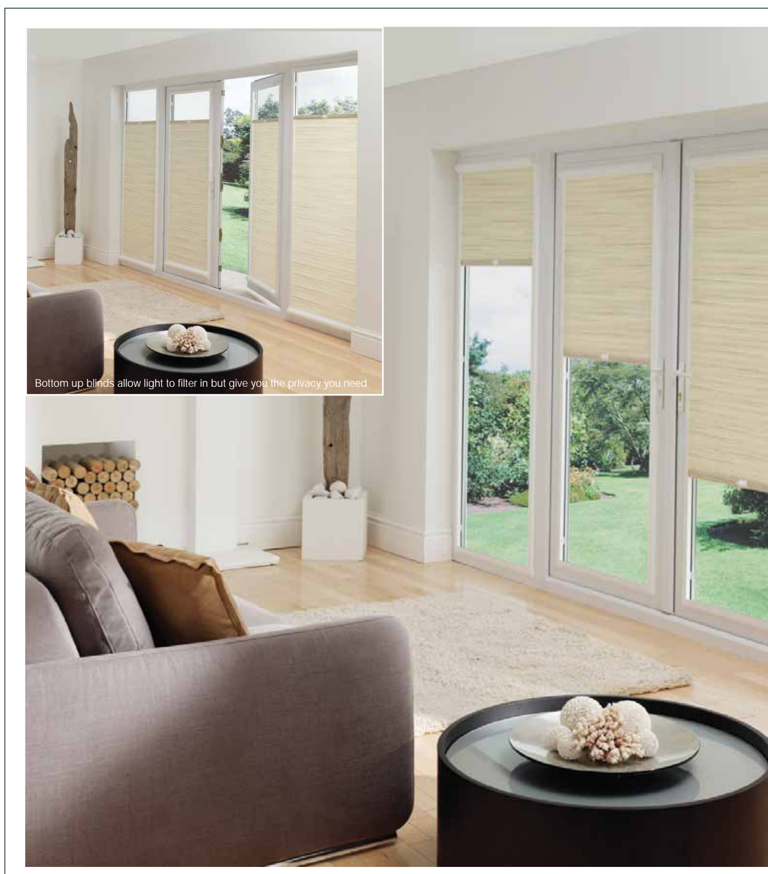
Two blinds in one! Pleated and roller blinds can be rotated 180° for increased privacy

Create beautiful rooms with Louvolite Perfect Fit®