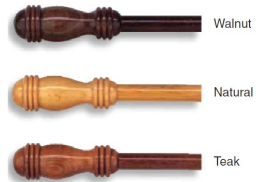
Wooden Draw Rod 100cm long. Singles DRWOODColour